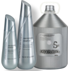
320ml 550ml 5L