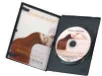
NANOKERATIN DVD NANOKERATIN SYSTEM DVD