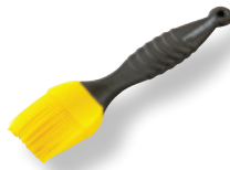
NANOKERATIN SILICON BRUSH B-1