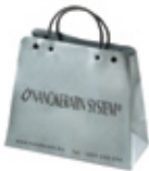
NANOKERATIN GIFT BAG GB-1